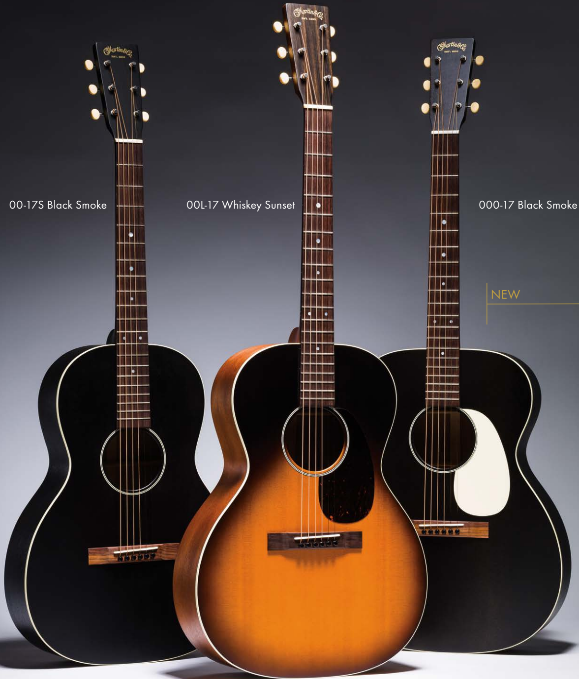
00-17S Black Smoke