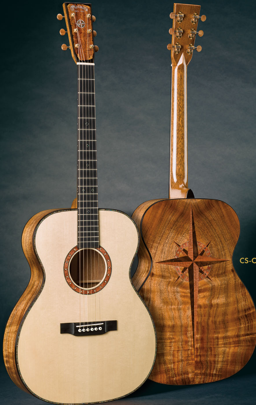
CS-OM True North-16